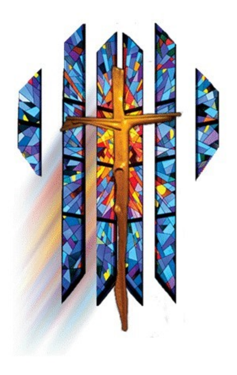
"At St. Philip Lutheran Church we intentionally build relationships through Christ to grow and serve."

St. Philip Lutheran Church 7531 S. Kendall Blvd. Littleton, CO 80128 303-979-4491 www.stphilip-co.org