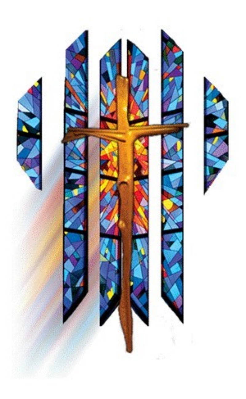
"At St. Philip Lutheran Church we intentionally build relationships through Christ to grow and serve."

St. Philip Lutheran Church 7531 S. Kendall Blvd. Littleton, CO 80128 303-979-4491 www.stphilip-co.org