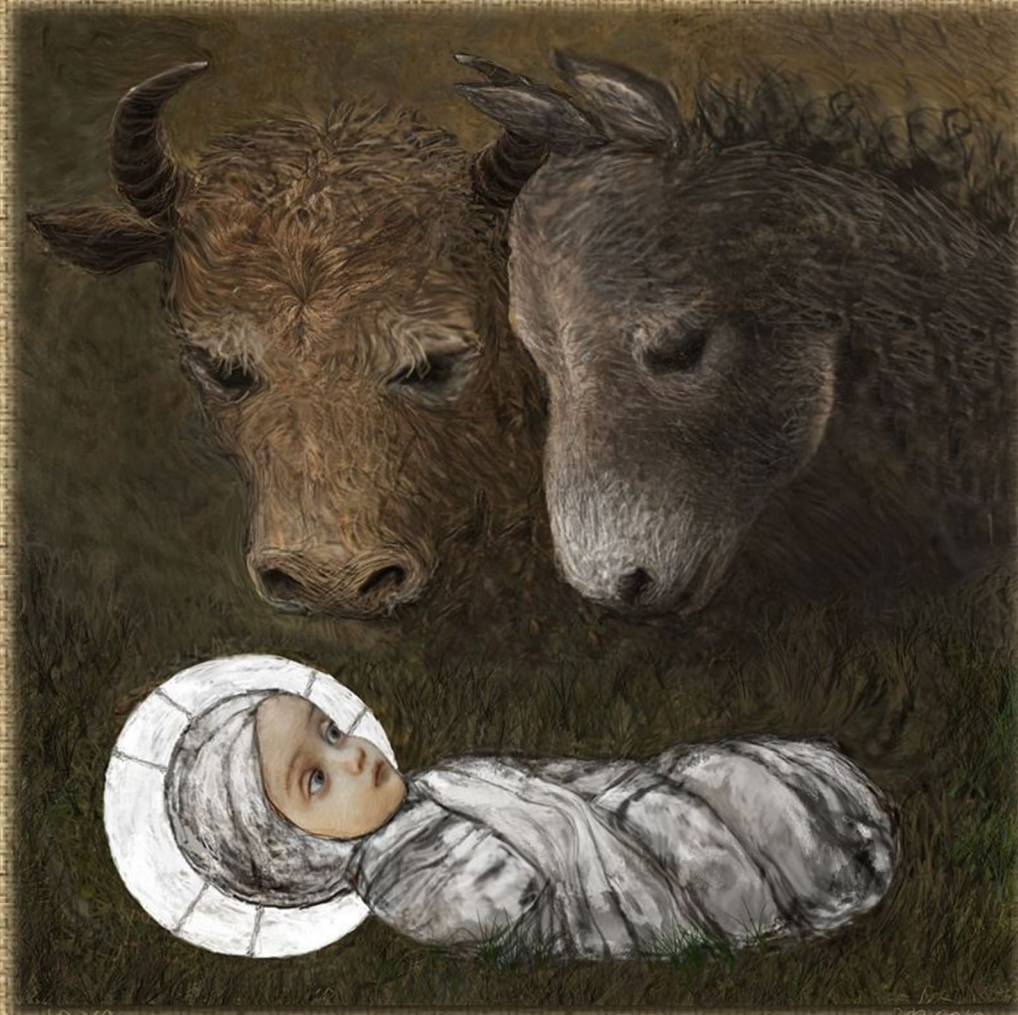
The Animals in the Stable